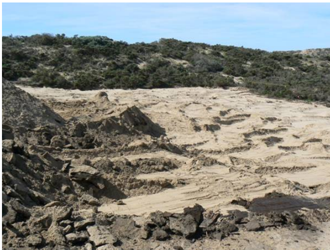
G1A Oil spray removal.