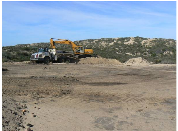
G1A Oil spray removal.