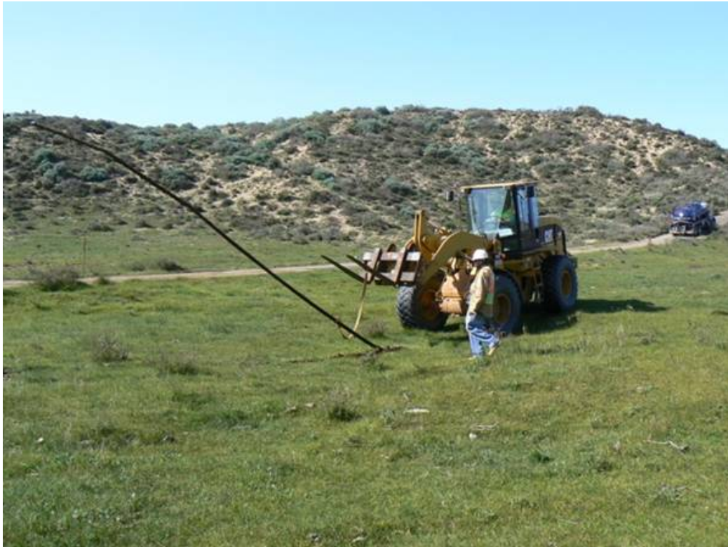
M12 Pipeline removal.

RTS continues to haul diluent-contaminated material from the TB8 Stockpile or TB9 stockpile sites to the Santa Maria Landfill. RTS currently has eighteen trucks hauling material to the landfill. For the week ending March 12, 2010, RTS hauled a total of 190 trips (approximately 4,255 tons of material). RTS has hauled a total of 38,954 loads of contaminated material to the landfill, which is approximately 890,236 tons of material. RTS trucks continue to remain off of Betteravia Road between 4:30 and 5:30 pm as detailed in the SLO County Conditions. The first trucks do not leave the Field until after 8:00 am each morning and the last loads arrive at the Landfill at approximately 3:45 (the landfill closes at 4 pm). Recon begins work at 7:00 am. Each truck is loaded with approximately 24 tons or 16 to 18 cubic yards of material.