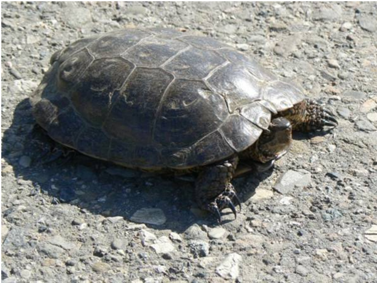
Southwestern pond turtle observed crossing road over a mile and a half from the Santa Maria River and Marsh Ponds.