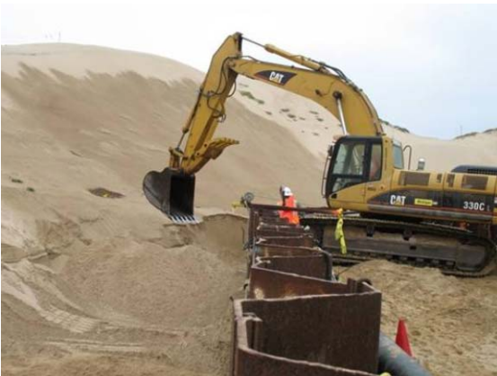
Excavating one of six trenches outside the B5A Excavation Site.

Chevron construction contractor, Entact, is constructing the new M3 Stockpile site and Loading Zone. During the preparation of this site a small portion of sump/oil spray material was observed, excavated, and hauled off from the site. This site will be eventually used to stockpile contaminated material from inland excavations sites (M4 and possibly I-II) and to direct load haul trucks as opposed to loading them at TB8.