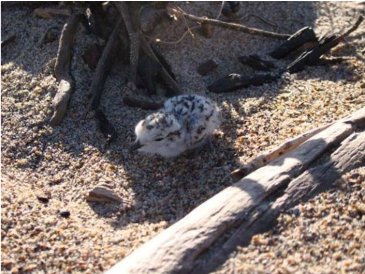
Life at Guadalupe: lounging Western snowy plover chick.