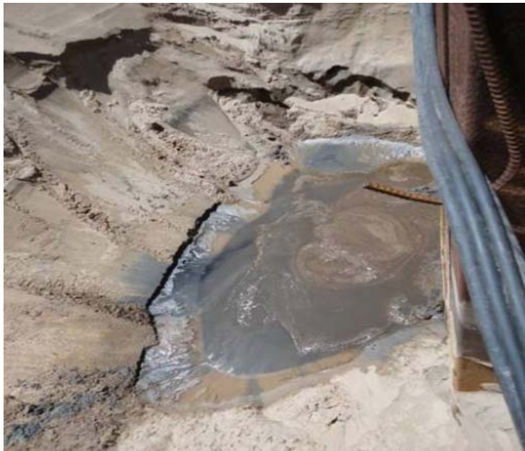
Some of the free floating product that remained in place after the B5A excavation of material outside the sheetpile wall.